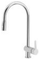
BLANCO RITA DUAL SPRAY