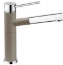
BLANCO ALTA DUAL SPRAY